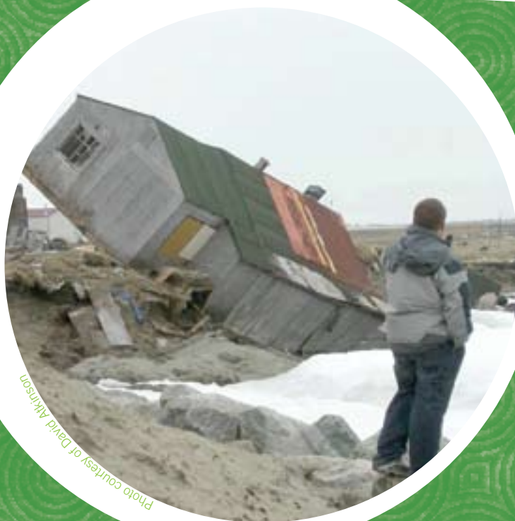
Coastal erosion in Shishmaref, Alaska

With scientific experts now predicting that the effects of climate change will be more severe and appear even faster than previously believed, it comes with little surprise that participants in the Summit from every world region shared observations and experiences of early impacts in their part of the planet. Climate change is not just a theory to us; it is a stark and dangerous reality.